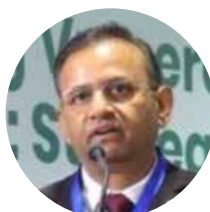
Ravi Ranjan, IFS PCCF & Chief Wildlife Warden (CWLW) Government of Jharkhand