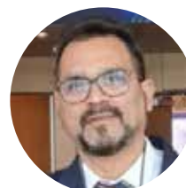
Arun Kumar Pandey, IFS PCCF & Chief Wildlife Warden (CWLW) Government of Chhattisgarh