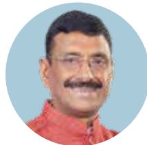
Shri Sanjay Seth Hon'ble Minister of State for Defence Government of India

The inaugural plenary sets the foundation for EKAM Dialogues by positioning India's resource heartlands - Jharkhand, Chhattisgarh, Odisha, and Bihar - as critical drivers of resilient and inclusive development. The session aims to reframe resilience as a cross-sectoral paradigm that integrates livelihoods, governance, culture, and economic systems. It will catalyse a shared vision for collaborative, community-led and future-ready pathways, while fostering alignment between policy, practice, and innovation to guide long-term regional transformation.