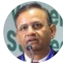
Ravi Ranjan, IFS PCCF & Chief Wildlife Warden (CWLW) Government of Jharkhand