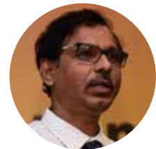
Sanjeev Kumar, IFS PCCF and HoFF Government of Jharkhand