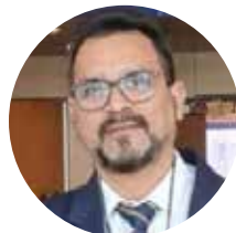
Arun Kumar Pandey, IFS PCCF and CWLW Government of Chhattisgarh